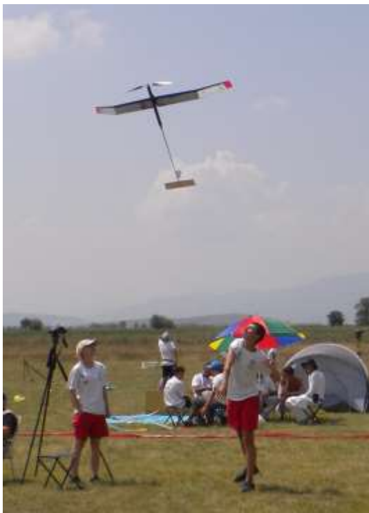
The 2 Polish flyoff participants during round 2: Filip Rudzinski launching, Zofia Zdancewicz watching.